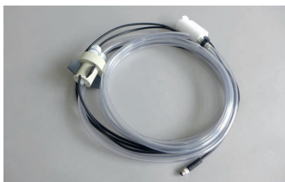
Tank level control 1005098